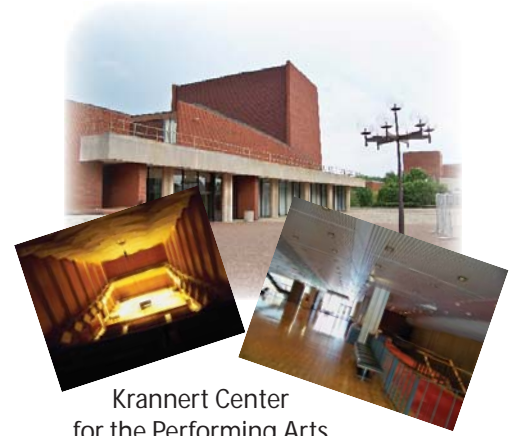
Krannert Center for the Performing Arts

Retrocommissioning employs a systematic approach to a building's mechanical systems. A team of engineers, field technicians, and tradesmen study the design and operation of a building to bring it to optimal operating conditions and identify energy conservation opportunities.