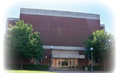
Newmark Civil Engineering Building